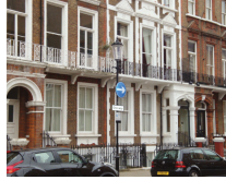
NEVERN SQUARE, SW5