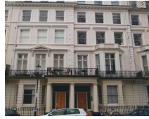
COURTFIELD GARDENS, SW5