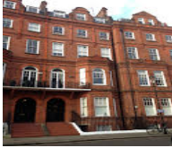
LENNOX GARDENS, SW1