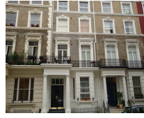
HOGARTH ROAD, SW5