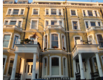
LEXHAM GARDENS, W8