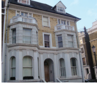
CAMPDEN HILL GARDENS, W8